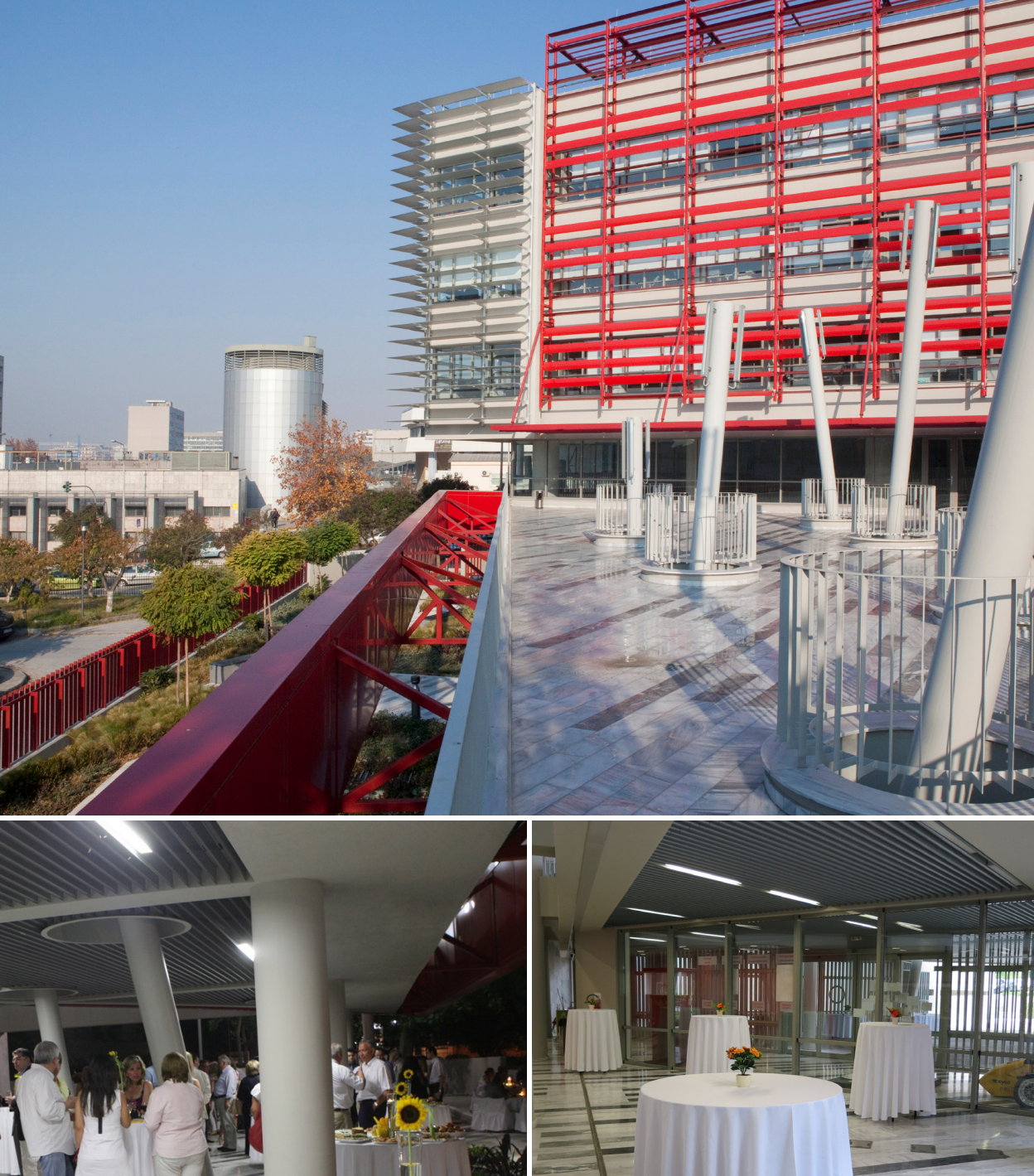
Specially designated areas for the organization of dinners, receptions and coffee breaks